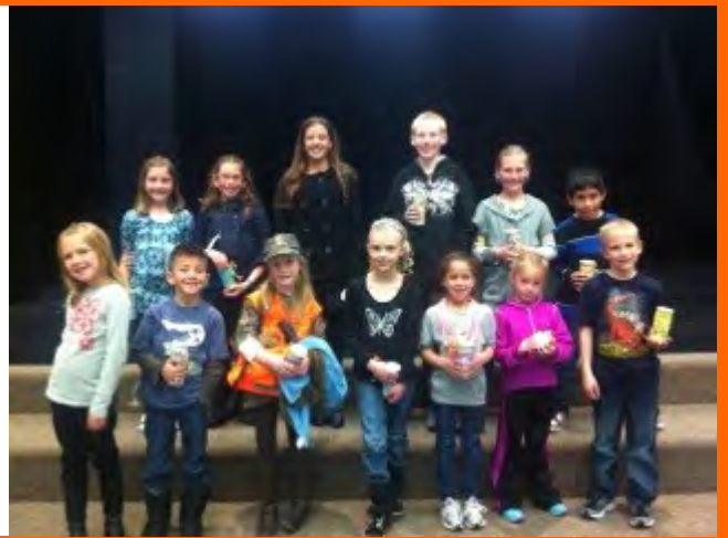
Congratulations to all of the Traverse Mountain Elementary Storytellers! They all told their stories at a recent school festival.