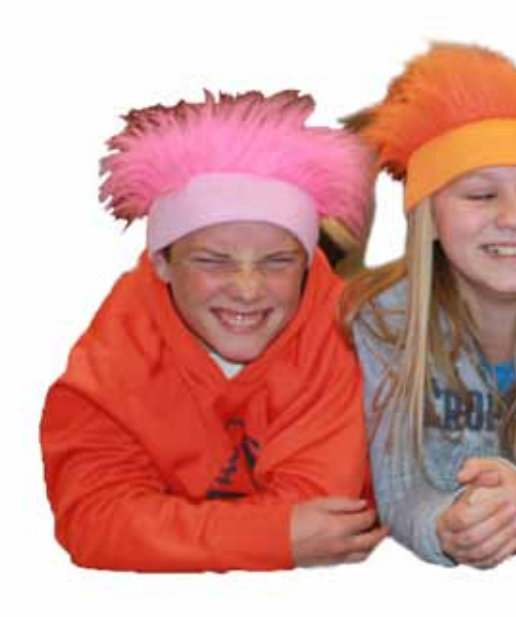
ALIGNING BEHAVIOR WITH POSITIVE SOCIAL VALUES