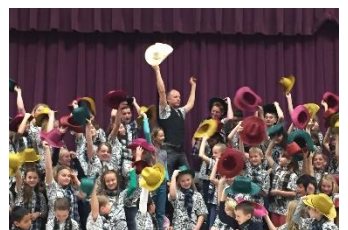
Saratoga Singing Sharks