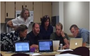
Proactive Collaborative Efforts