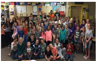
Cross Grade Level Teaming