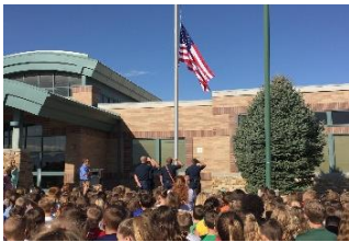
Building Student Love of Country