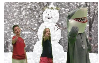
The Stand4Kind Initiative

STUDENT ENROLLMENT: 881 MASCOT: CHOMP MOTTO: IT'S A GREAT DAY TO BE A SHARK!