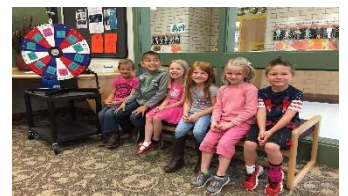
Rewarding Good Behavior with The Wheel of Fortune