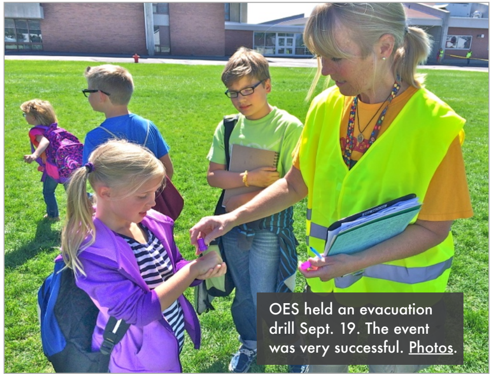
OES held an evacuation drill Sept. 19. The event was very successful. Photos.

Make it a great day—or not. The choice is yours.