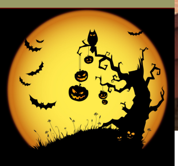
Volume 8, Issue 2 October 19, 2015