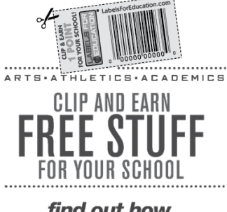
find out how LabelsForEducation.com

Labels for Education helps us earn supplies and other materials for our school. Collect them from soup cans. etc. and turn them into your class.