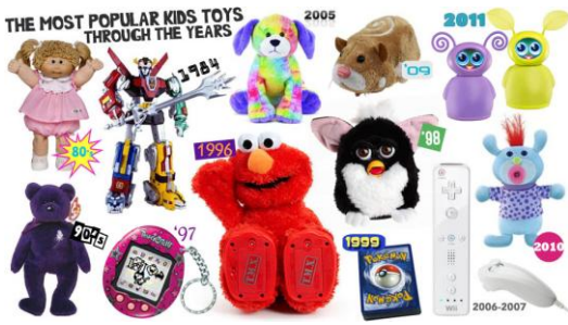
TOYS & PETS AT SCHOOL

We ask for your patience as you drop off or pick up your child from school. There are teachers on duty to help direct your students. Remember that saving a few minutes is never an excuse for putting a child in danger. Your cooperation is appreciated.