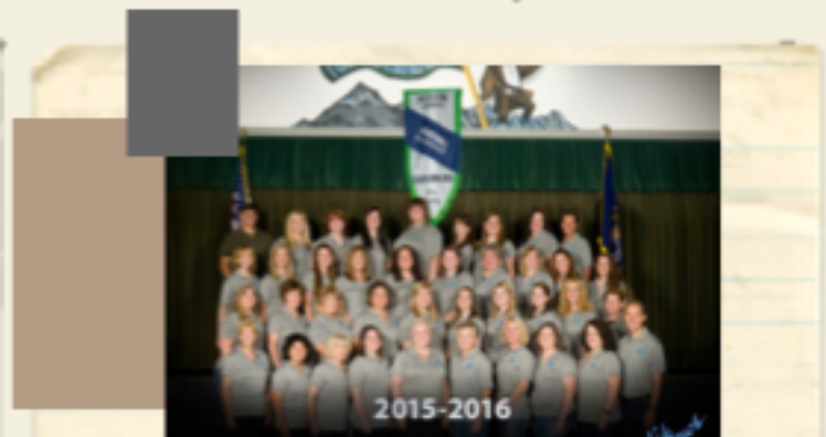
Our Fabulous Faculty