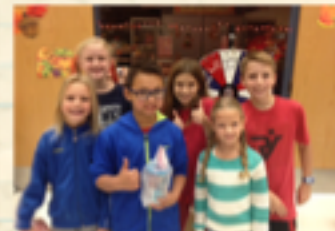
Wheel of Fortune Winners