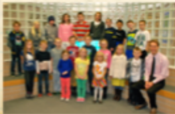
Students of the Week (Every student recognized)